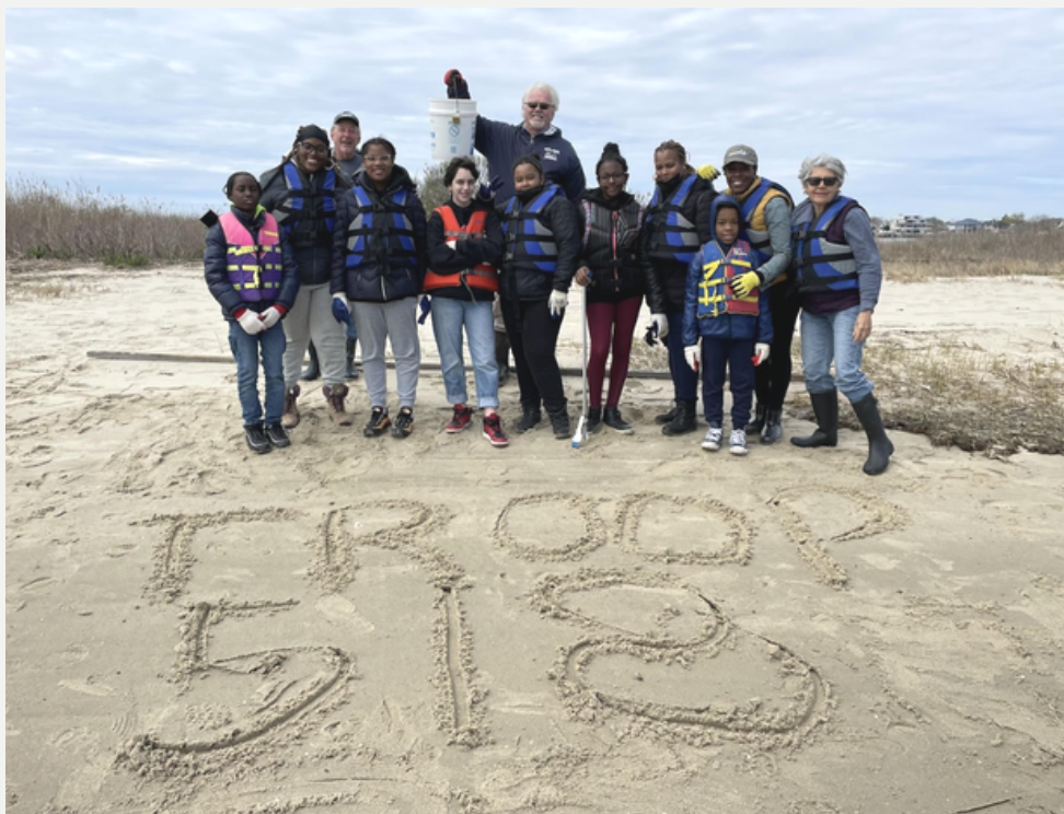
Troop 518 poses with Operation SPLASH after cleanup!

After this video, my troop and I proceeded to head out on a boat to one of our local beaches to help clean up. You would be surprised to see how much trash was collected from the beach. Please help save animals like Inky from pollution.