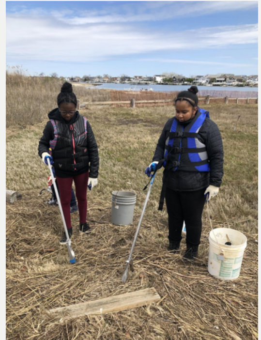
Troop 518 picks up litter. Even seemingly small actions can make a difference.

When we finished, it was incredible to look at the impact I made on the environment and ecosystem. Learning that such small actions, like picking up a few pieces of garbage, can completely change someone or something's life made me feel proud and accomplished with what I did that day with my troop.