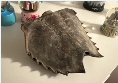
Iyana's horseshoe crab shell!

On the bright side, I found the shell of a horseshoe crab and kept it as a souvenir! My troop and I went for pizza after cleaning up the shore and talked about weird or unique pieces of trash we collected, like my horseshoe crab shell.